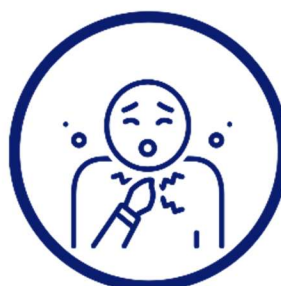
Gurgling, choking noise