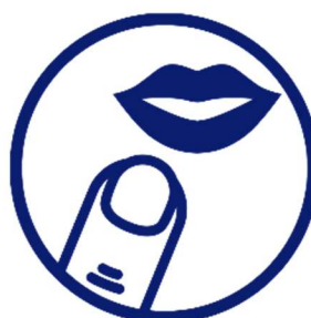
Blue/purple fingernails & lips