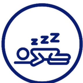
Can't be woken